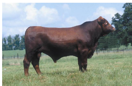
CX-RF Dominator 23K (20 months old)