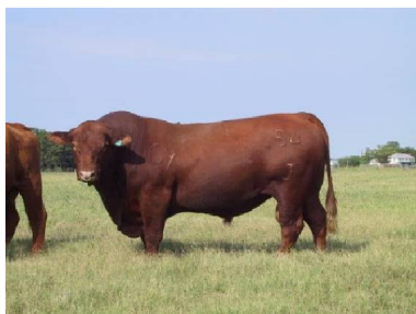
CX Paymaster 54J 1/4 Blood